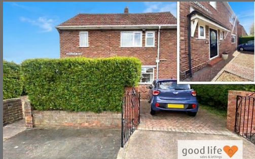
3 Bed Corner Semi - Det House good life

Radcliffe Road Redhouse Sunderland SR5 5RG